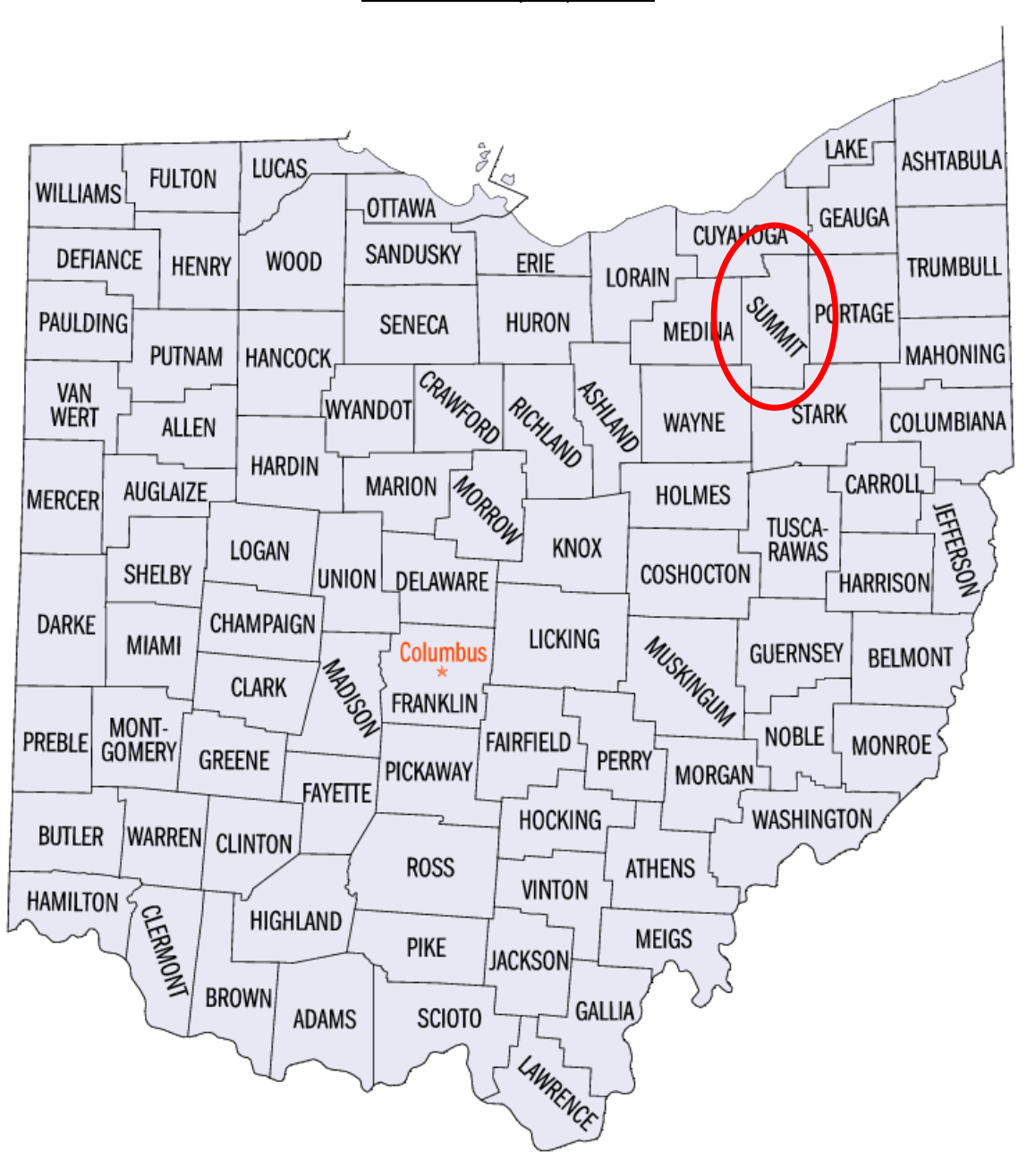
Exhibit A: County Map of Ohio